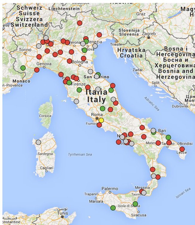
Fig. 2. Locations considered for the propagation analysis.